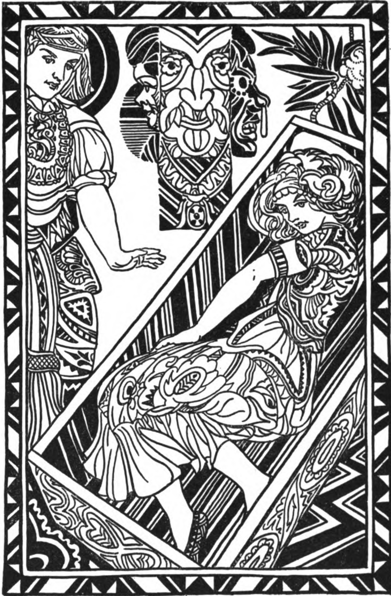
The Chest Opened and the Prince Saw the Beautiful Maiden